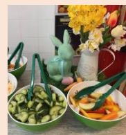
Springtime salad bar at lunchtime