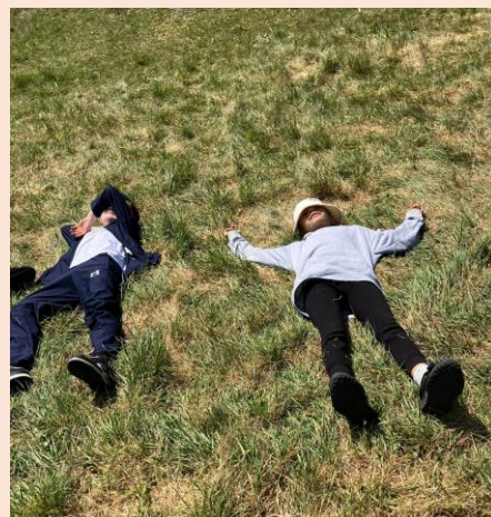
Tired but happy at Frylands!